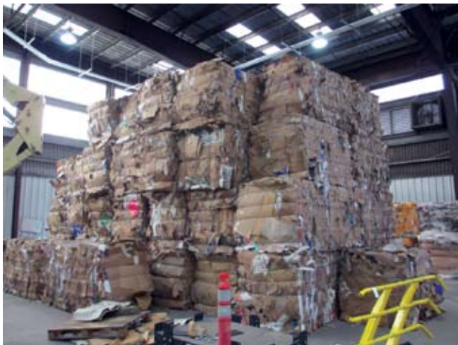
Recyclables...Ready for Their New Life