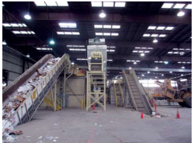
Mixed Waste Processing Facility