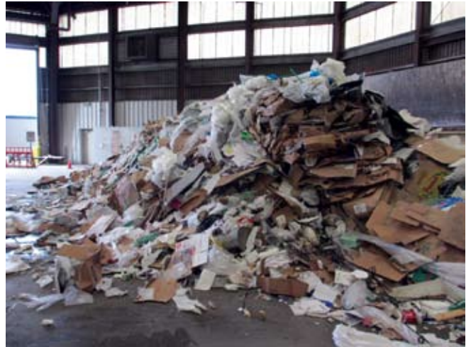
Mixed Commercial Waste

Utilizing mechanical, optical and manual processes, Valley Vista Services and Grand Central Recycling can assure you that every effort is being made to divert your recyclable materials from local landfills.