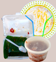
Plastic Utensils, Straws, Dirty Take-Out Containers