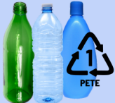
#1 PET Plastic Containers