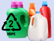
#2 & #3 Plastic Containers