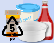
#4-#7 Plastic Containers