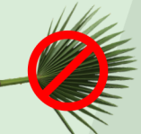
No Palm Fronds