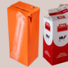
Juice Boxes & Milk Cartons