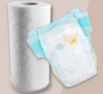
Diapers, Used Paper Towels