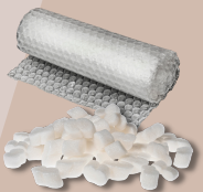
Styrofoam, Plastic Film, Plastic Bags