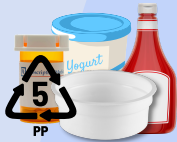
#4, #5, #7 Plastic Containers