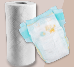
Diapers, Used Paper Towels