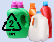
#2 & #3 Plastic Containers