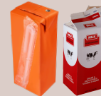
Juice Boxes & Milk Cartons