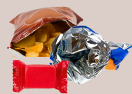
Bags & Wrappers