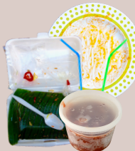
Plastic Utensils, Straws, Dirty Take-Out Containers