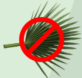
No Palm Fronds