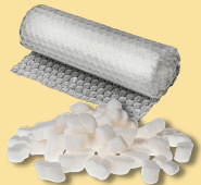
Styrofoam, Plastic Film, Plastic Bags