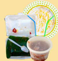
Plastic Utensils, Straws, Dirty Take-Out Containers