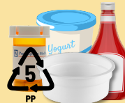
#4-#7 Plastic Containers