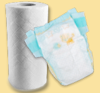
Diapers, Used Paper Towels