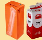
Juice Boxes & Milk Cartons