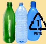
#1 PET Plastic