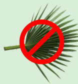
No Palm Fronds