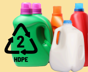
#2 & #3 Plastic Containers